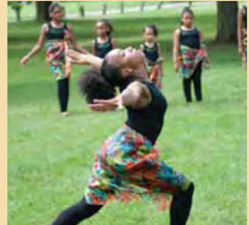
African-Latin Fusion dance performances by students from Soul Xpression School of the Arts entertained and inspired attendees.

Interested in sponsoring the 15th Annual Diversity Stride Walk-a-Thon celebration? Want to volunteer? Please email pjones@jcreativeenterprises.com for ways you can help support this community-building program.