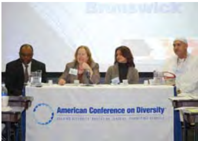
Our interfaith panel discussion intersects healthcare and cultural competency.

On Thursday, May 14, the American Conference on Diversity will present the 6th Health Equity Conference . Developed for healthcare professionals and health system administrators, the full-day conference will feature dynamic diversity speakers, panel discussions, and learning sessions to help foster more health literate organizations throughout the tri-state area. The Health Equity Conference in May will be one of two ACOD initiatives in 2015 funded by Horizon Blue Cross Blue Shield of New Jersey and aimed at closing the healthcare disparities gap. Thank you to our community partners: Robert Wood Johnson University Hospital, HealthSouth Rehabilitation Hospital, and Acute Care.