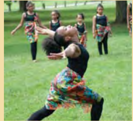
African-Latin Fusion dance performances by students from Soul Xpression School of the Arts entertained and inspired attendees.

Interested in sponsoring the 15th Annual Diversity Stride Walk-a-Thon celebration? Want to volunteer? Please email pjones@jcreativeenterprises.com for ways you can help support this community-building program.