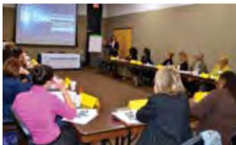
The Train-the-Trainer program provides continuing nursing education activity contact hours from the New Jersey State Nurses Association.